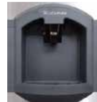
Easy Push Chute