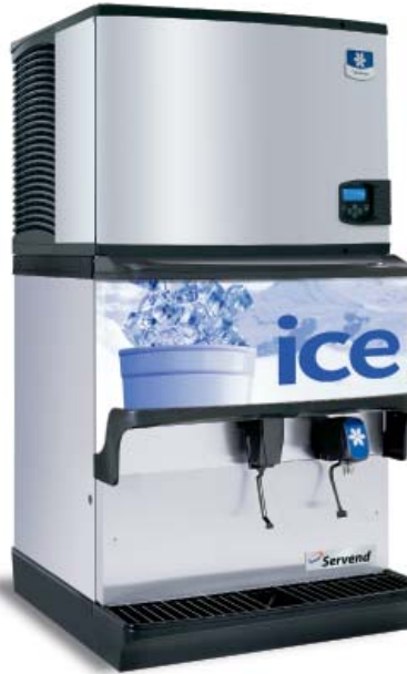
S-250 with water valve and Indigo Ice Machine