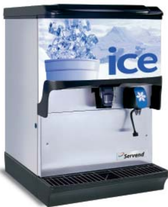
S-150 with water valve