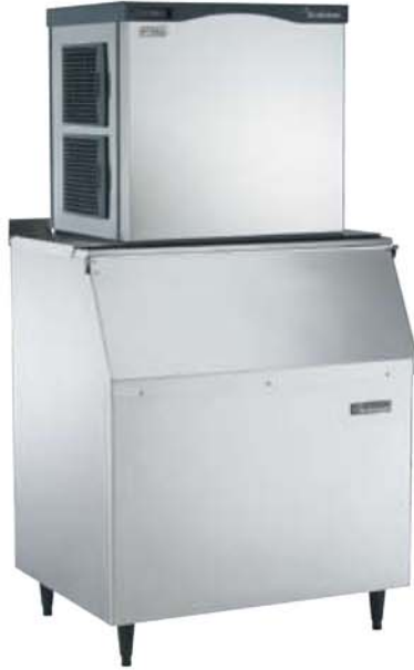
Shown on BH801S-A bin.