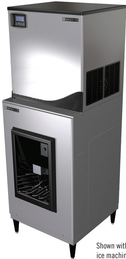
Shown with Maxx Ice modular ice machine (sold separately)

The Maxx Ice Hotel Ice Dispenser delivers a high-capacity storage and easy to use ice dispenser solution. The MIDX200 will fit most commercial 30" modular ice machines and the full line of Maxx Ice 30" modular ice machines. The dispenser features a simple push button operation and a lift wheel agitation/ dispensing system to prevent ice clumping.