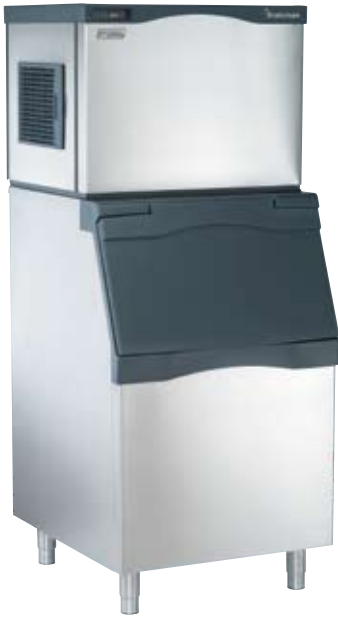
Shown on B530S bin with optional KLPSS legs.