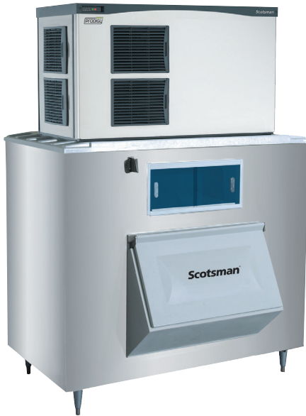
Shown on BH1600SS bin.