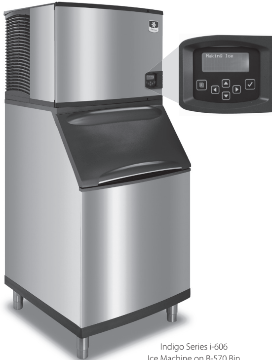
Indigo Series i-606 Ice Machine on B-570 Bin

Designed for operators who know that ice is critical to their business, the Indigo™ Series ice machine's preventative diagnostics continually monitor itself for reliable ice production. Improvements in cleanability and programmability make your ice machine easy to own and less expensive to operate.