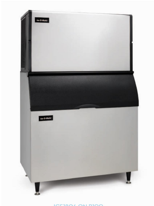
ICE1806 ON B100