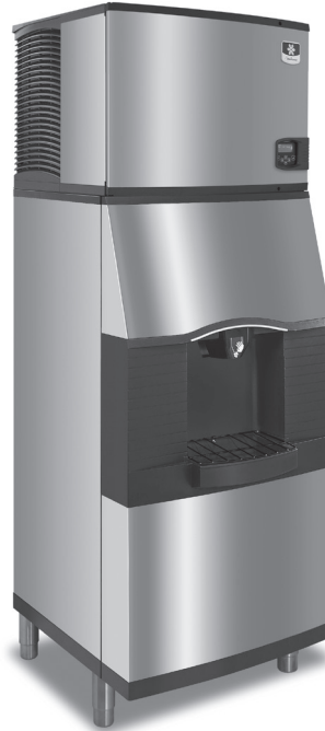
Indigo Series 450 Ice Machine SFA-291 Ice & Water Dispenser