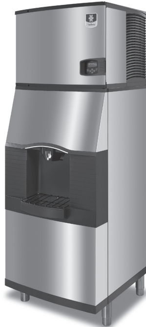
Indigo Series 450 Ice Machine SPA-310 Ice Dispenser

Ice only dispense, with coin-op and room card dispensing control options