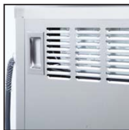
Shown with standard pull handles