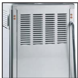
Shown with optional rear mix lights

Convenient recessed pull handles for ease in moving the equipment for cleaning.